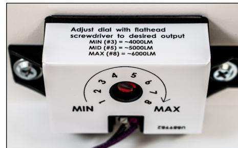
For ALO6 configurations