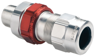
ABB cable glands – STEX Star Teck® extreme series Hazardous locations

The STAR TECK® STEX Explosion Proof fitting for Teck, MC and ACWU cable set the standard for ease of installation, quality engineering and safe, reliable terminations in challenging industrial environments. The STEX offers a broader cable range per fitting compared to the regular STX series.