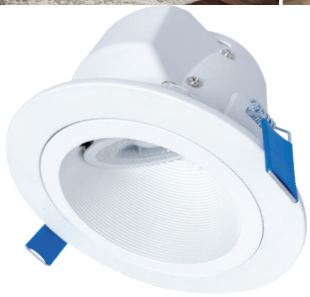
RLS4099FS1EWHDMR 4-inch Slope Ceiling Downlight