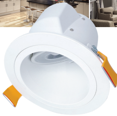
RLS6159FS1EWHDMR 6-inch Slope Ceiling Downlight