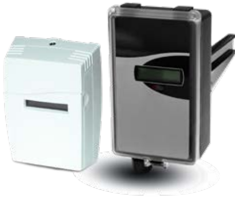
Sensors sold separately

Connecting the CO2 sensor to the over-ride terminals on our Fresh Air Ventilation panel activates the On Demand Ventilation function to provide fresh air into areas or rooms with high concentrations of CO2. Contact iO HVAC Controls for engineering and installation instructions and schematics. The A-SENSE room and duct transmitters monitor the carbon dioxide (CO2) levels in industrial, school, and office type environments.