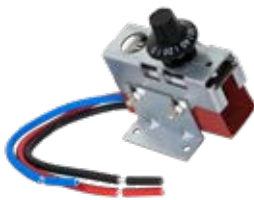
Outdoor Thermostat iO-ODT