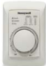
Humidistat H8908A SPST