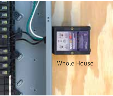
Action videos and full details @rectorseal.com/surgeprotection