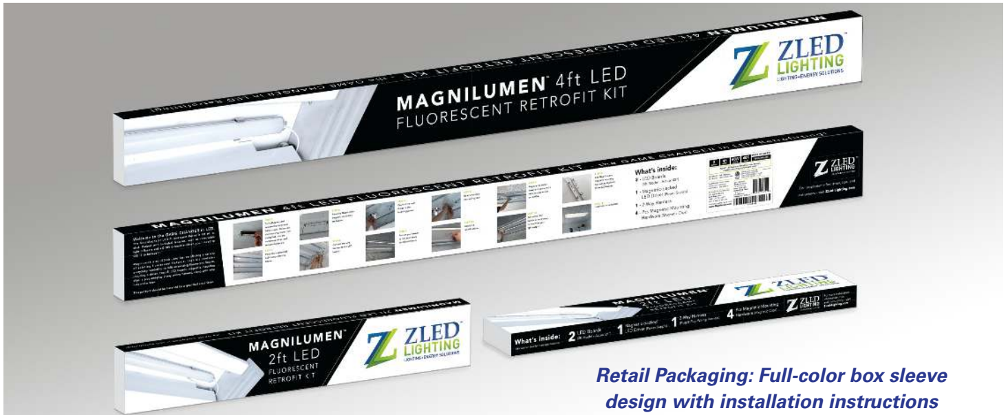
Retail Packaging: Full-color box sleeve design with installation instructions

MUST SPECIFY IF ORDERING RETAIL PACKAGING (Available only on kits listed in table below)