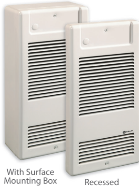
With Surface Mounting Box