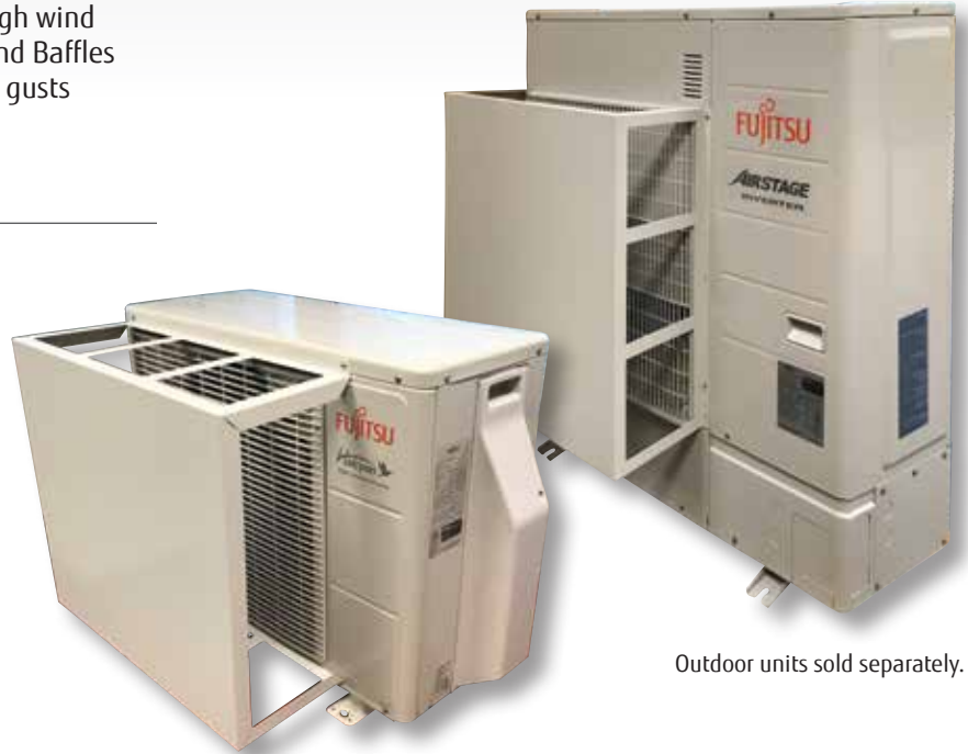
Outdoor units sold separately.