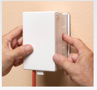
To close: Bow out sides of extended cover and push in.