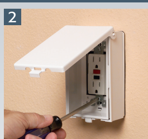
Install wiring device per manufacturer's instructions, Local and National Electrical Codes using the pre-drilled holes in base.