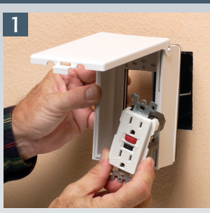
Feed device through opening (cover is removable for easier access).