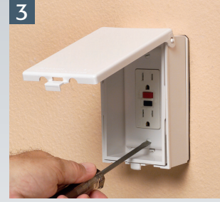
Install plate and the installation is done!