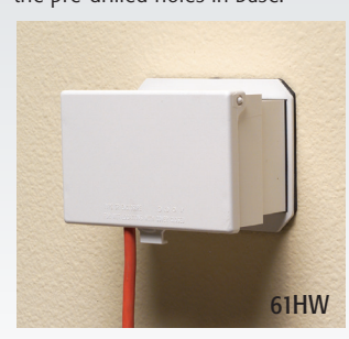
OUT to PLUG IN for weatherproof-in-use!