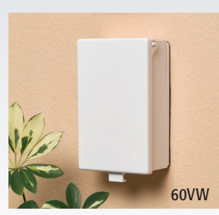
IN for GOOD LOOKS and to stay bug free...