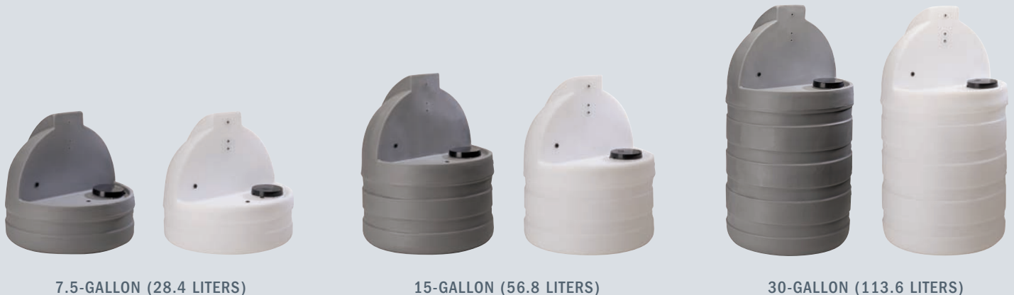
7.5-GALLON (28.4 LITERS)