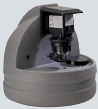
7.5-GALLON (28.4 LITERS)