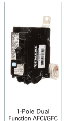
1-Pole Dual Function AFCI/GFCI