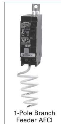
1-Pole Branch Feeder AFCI