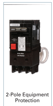
2-Pole Equipment Protection