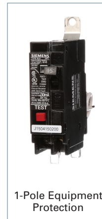
1-Pole Equipment Protection