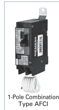
1-Pole Combination Type AFCI