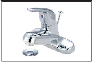
# L-6162H SHOWN ADA