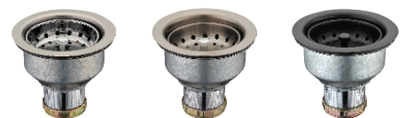
Deep Cup Basket Strainers