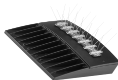
BSW - Bird-deterrent spikes