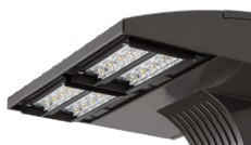
HS - House-side shields