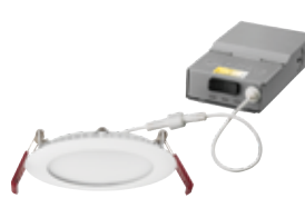
6" Wafer LED Downlight