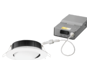
4" Round Gimbal Downlight