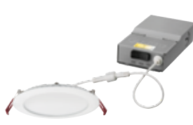
4" Wafer LED Downlight