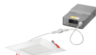
8" Wafer LED Square Downlight