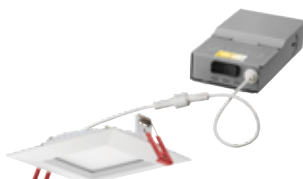
4" Wafer LED Square Downlight