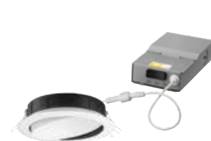
6" Round Gimbal Downlight