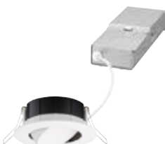
3" Round Gimbal Downlight