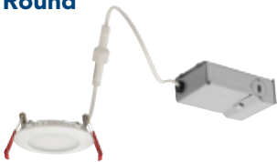
3" Wafer LED Downlight