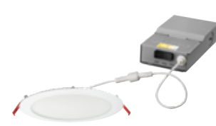
8" Wafer LED Downlight