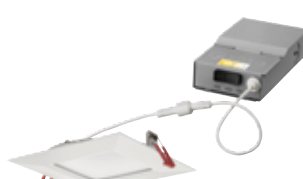
6" Wafer LED Square Downlight