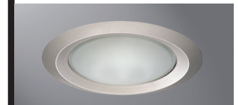
5150SN Frost Lens with Reflector, Satin Nickel Plastic Trim