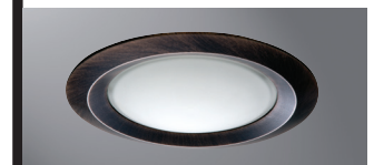
5150TBZ Frost Lens with Reflector, Tuscan Bronze Plastic Trim