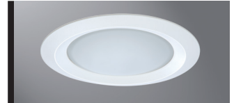
5150WH Frost Lens with Reflector, White Plastic Trim

*UL1993 listed LED & CFL equivalent lamps permitted. Consult lamp manufacturer for conditions of use. Cooper Lighting Solutions does not warranty the lamp.