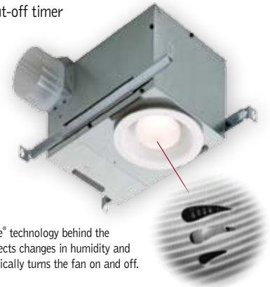
SensAire® technology behind the trim detects changes in humidity and automatically turns the fan on and off.