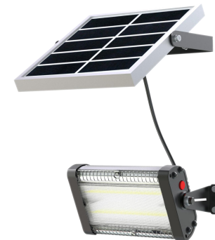
CL-SWL-15P Equal to 300W