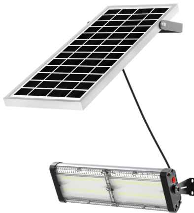
CL-SWL-40P Equal to 600W