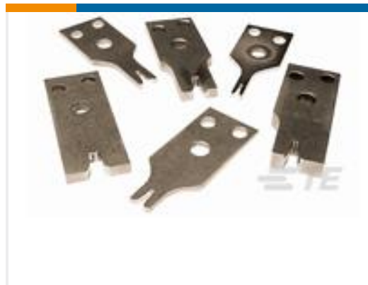
TE Model / Part #2-456406-5 WIRE CRIMPER .090