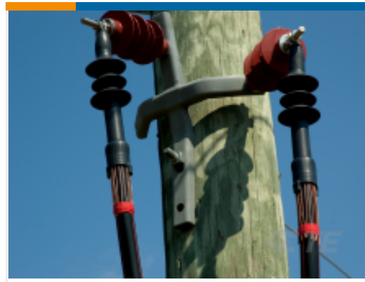
TE Model / Part #655591-000 One Core Polymeric Cables Termination