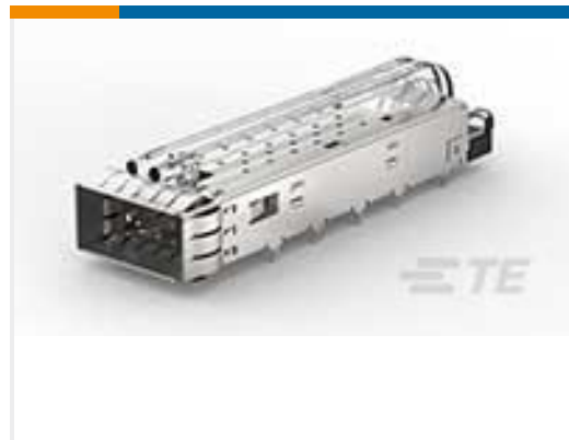
TE Model / Part #2170773-1 CAGE ASSY, QSFP28 1X1, SPRING, LP