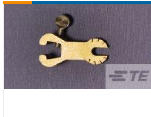
TE Model / Part #306349-2 AMPACT TOOL HOLDER FOR 69437