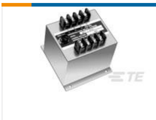
TE Model / Part #2-1618108-3 WOV-3-440=WILMAR OVERVOLTAGE 4