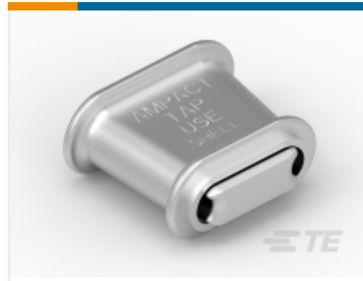
TE Model / Part #2182246-2 AMPACT AI Tap Special 2-6 sol, 4 sol