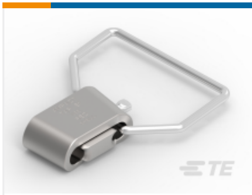
TE Model / Part #2182247-1 AMPACT AI Stirrup 4-2 bail