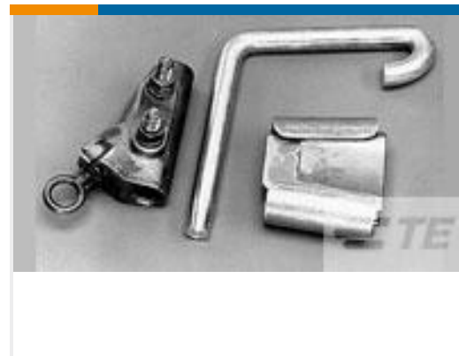
TE Model / Part #83470-4 AMPACT STUD&DISC KT