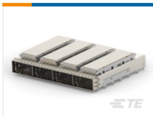
TE Model / Part #2354935-1 CAGE ASSEMBLY, 1X4, QSFP28, TB