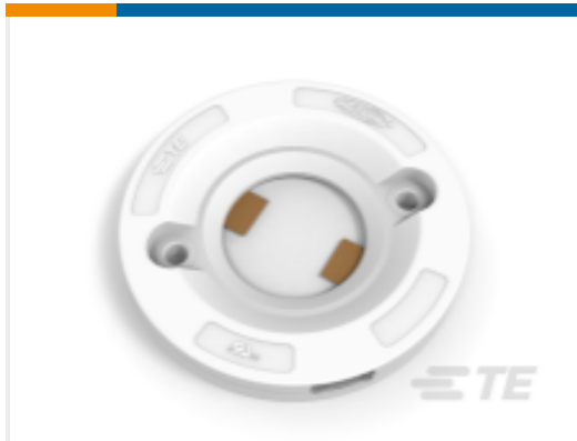
TE Model / Part #1-2316511-2 LUMAWISE DRIVE TYPE Z50: DALI SERIES