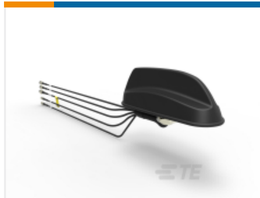
TE Model / Part #2332157-3 SHARK FIN MIMO ANTENNA SERIES