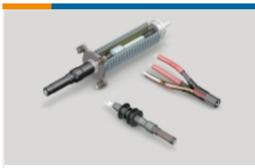
Power Cable Terminations(45)