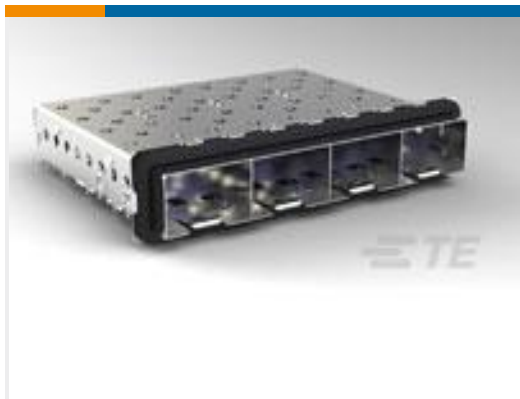
TE Model / Part #2057833-1 SFP+ Enhanced 1x4 Cage Assy