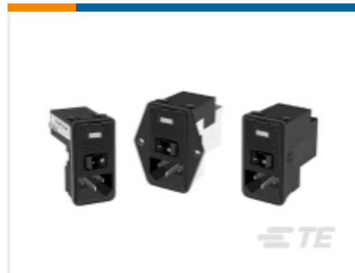
TE Model / Part #1-6609106-4 CORCOM P SERIES MULTI- FUNCTION INLET FIL