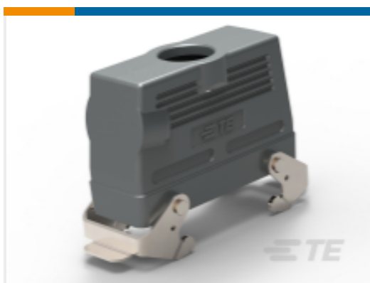
TE Model / Part #T1280242132-000 H24B-TGBH-M32