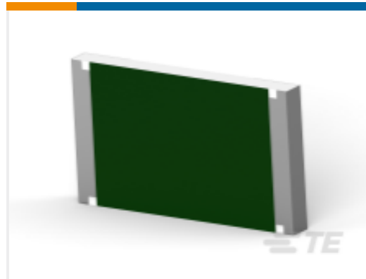
TE Model / Part #8-2176407-8 3560 27R 5%