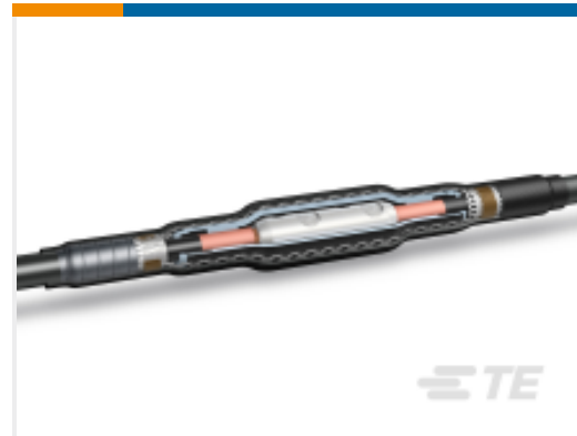
TE Model / Part #CF9557-000 In-Line Joint: Cold Shrink, 15-35 kV