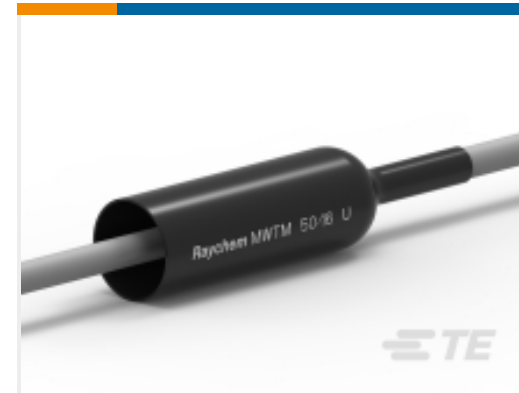
TE Model / Part #972191-000 Medium-Wall Heat Shrink Tubing