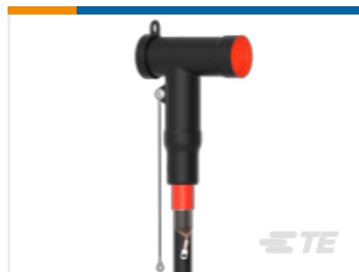
TE Model / Part #CM0003-005 Screened Separable Connectors 1250 A