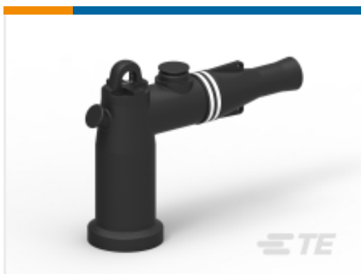
TE Model / Part #EE5628-000 Load Break Elbow: 200A, 15 and 25 kV