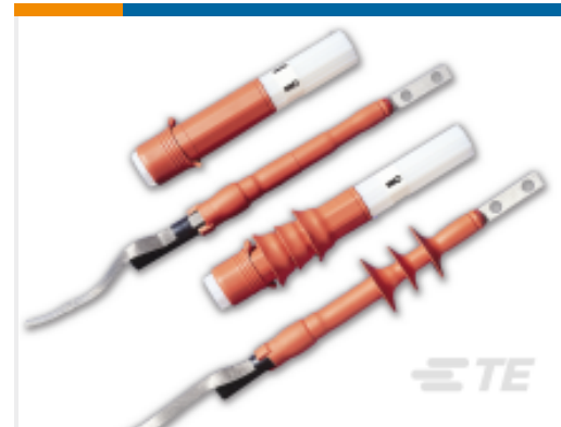
TE Model / Part #607863-000 Indoor and Outdoor Cable Terminations