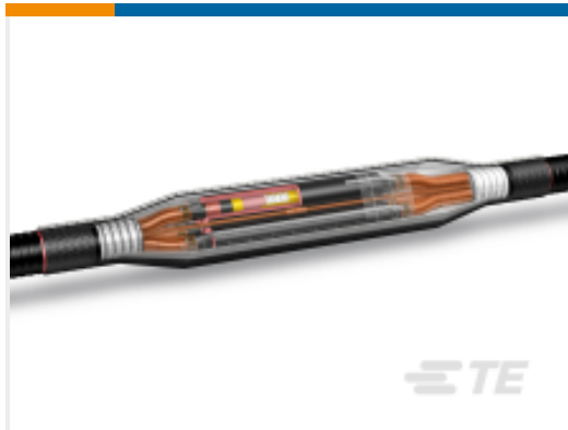
TE Model / Part #277013-000 In-Line Splices For 3/C Armored Cables