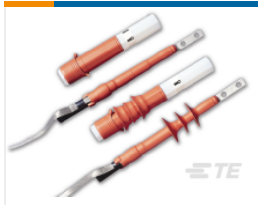
TE Model / Part #119593-000 Indoor and Outdoor Cable Terminations