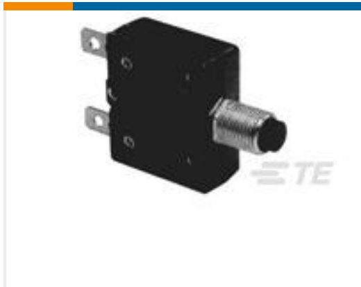
TE Model / Part #4-1423674-9 W54-XB2A99C10-25=CKTBKR,THERM,