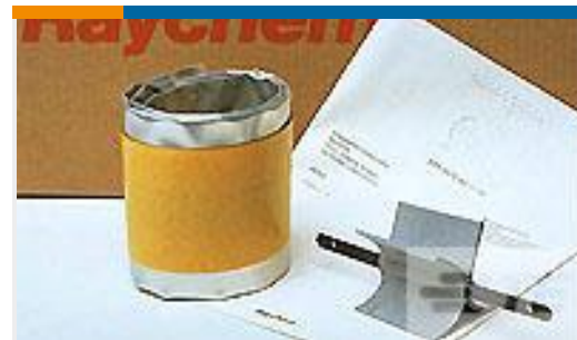
TE Model / Part #196693-000 RDSS-CLIP-45(S5)