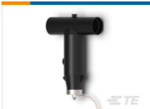
TE Model / Part #CS1360-000 Elbow Arresters: 600A, 35 kV