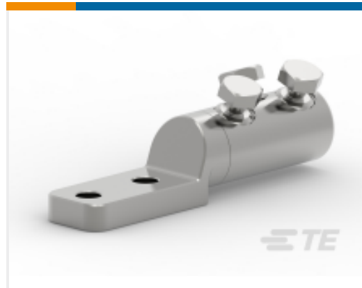
TE Model / Part #1974132-1 2-Hole Terminal Lugs