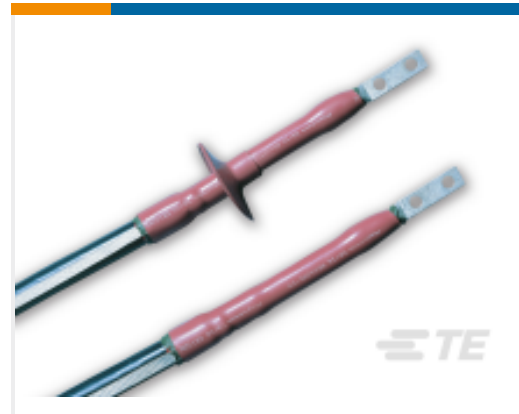
TE Model / Part #D14038-000 Terminations for Shielded Cables