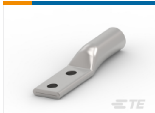
TE Model / Part #1-1099939-4 COMP TERM, CU 750 L BARREL