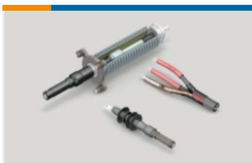
Power Cable Terminations(45)