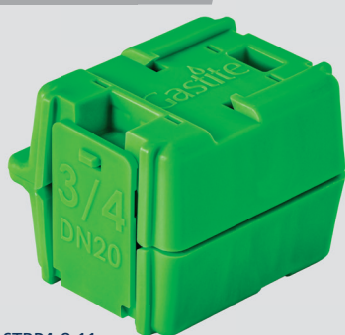
STRP4-8-11 cuts 1/2" & 3/4" CSST