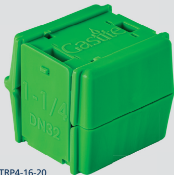
STRP4-16-20 cuts 1" & 1-1/4" CSST