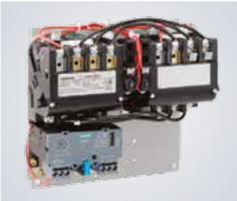
Reversing Non-Combination: Class 22 Combination: Class 25, 26