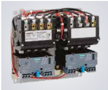
Two-Speed Non-Combination: Class 30 Combination: Class 32