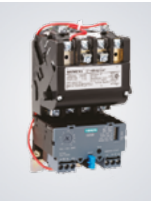
Non-Reversing Non-Combination: Class 14 Combination: Class 17, 18

Half-size starters feature all the rugged performance characteristics of our NEMA rated starter sizes, but are fractionally sized to more closely match your exact motor rating. As a result, significant economic savings are made possible without sacrificing the reliability you expect from a heavy duty starter. Exclusive "half-sizes" save potentially hundreds, even thousands of dollars per project. Every half-size starter saves you money—up to 31% as illustrated in the table. All "half-sizes" comply to applicable UL standards.