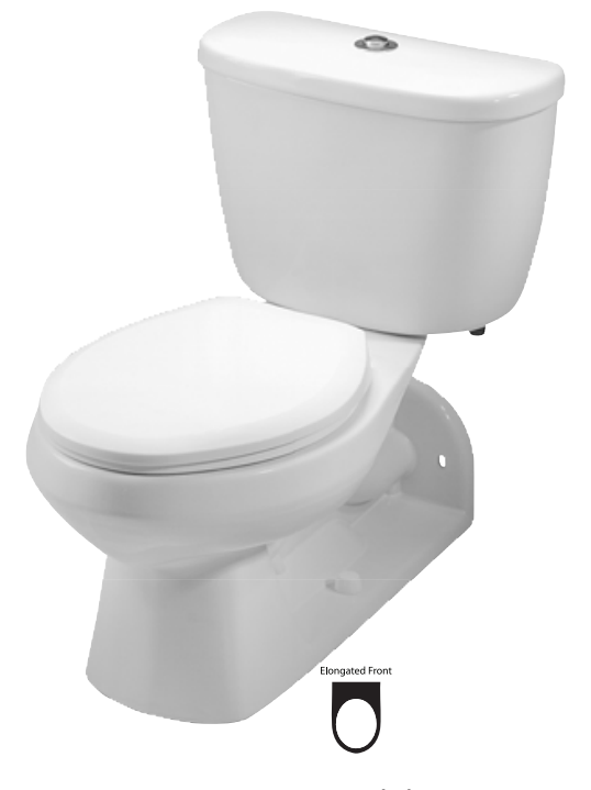
Model 149-154 Toilet seat not inlouded