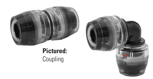
Pictured: 90° Elbow

Saturated Steam (WSP): Not suitable for steam service