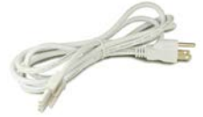
72" Cord & Plug