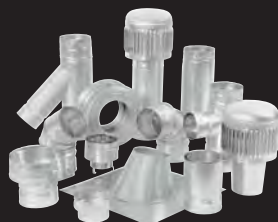
TYPE-B GAS VENT