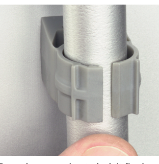
Press down on pipe to lock it firmly in place.