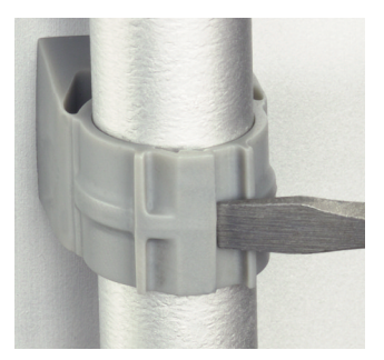
Removable. Use screwdriver to lift tab.