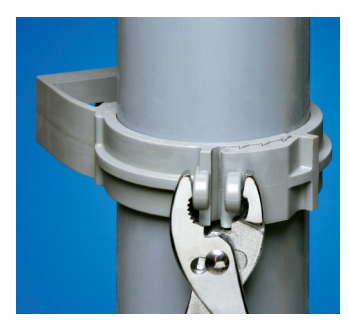
2-1/2" - 4" Press pipe into QuickLatch, up to the first notch to lock it in place. Finish by squeezing tabs together for a super-secure hold.