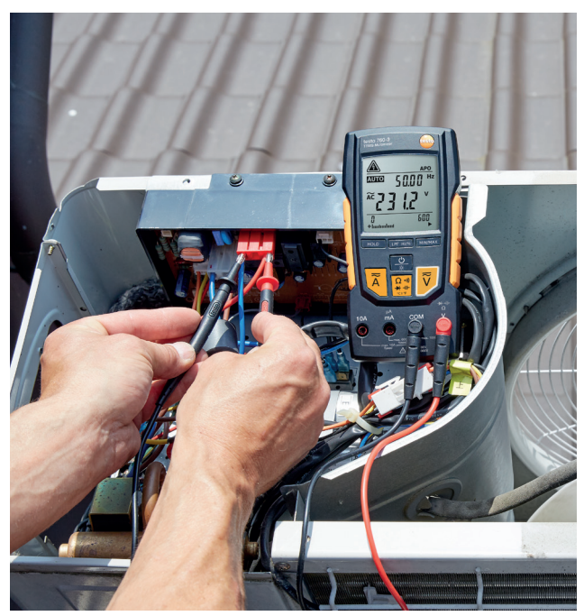
Measuring voltage on an air conditioning condenser with testo 760.