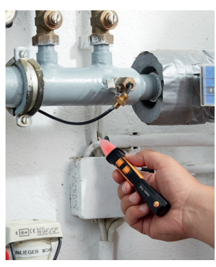
Checking for live voltage in a junction box with testo 745.