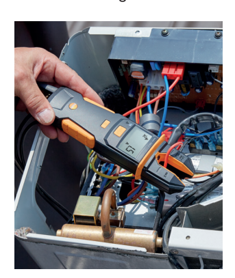
Measuring current on an air conditioning system with testo 755.