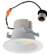
NLPR-442 4" Baffle WW, BZBZ