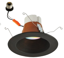
NLPR-5642 5 1/6" Baffle WW, BZBZ