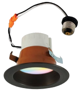
NLPR-441 4" Reflector WW, BZBZ