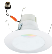
NLPR-5641 5 1/6" Reflector WW, BZBZ