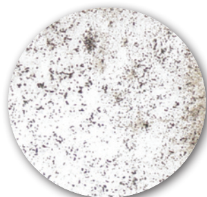
Standard plastic pan with visible mold

Microbes can double every 20 minutes on an untreated surface!