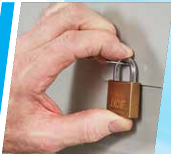
STANDARD on new 11 EER Wall-Mounts