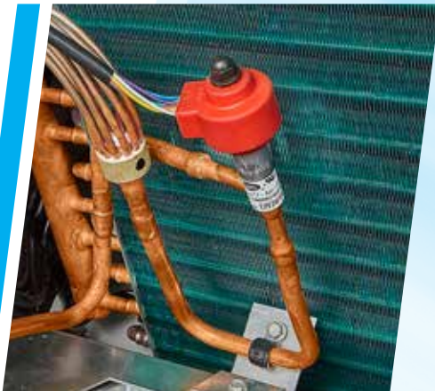
OPTIONAL on new 11 EER Wall-Mounts