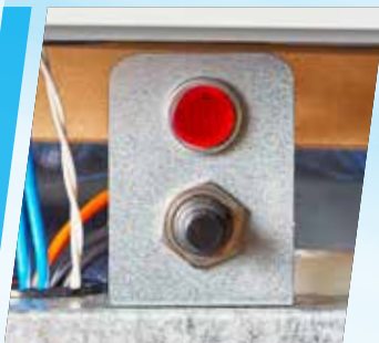
OPTIONAL on new 11 EER Wall-Mounts