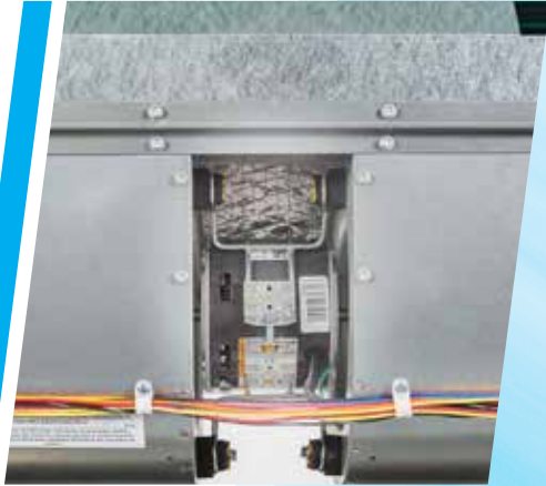
STANDARD on Wall-Mounts