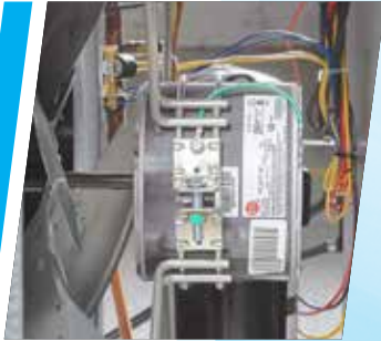
STANDARD on new 11 EER Wall-Mounts

Find out how telecom, school systems, e-buildings, modular structures and others use Bard to their advantage by visiting our website at bardhvac.com