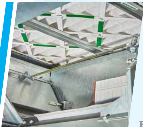
OPTIONAL on new 11 EER Wall-Mounts