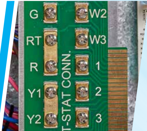
STANDARD on new 11 EER Wall-Mounts

Bard is leading the industry from 11 EER and beyond. Quieter operation, healthier air quality, higher operating efficiencies and environmentally friendly solutions – we deliver ingenious simplified design with the most innovative technology inside. Meet our newest advanced technologies.