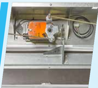
OPTIONAL on new 11 EER Wall-Mounts