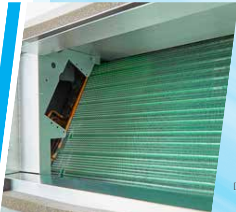
STANDARD on Wall-Mounts