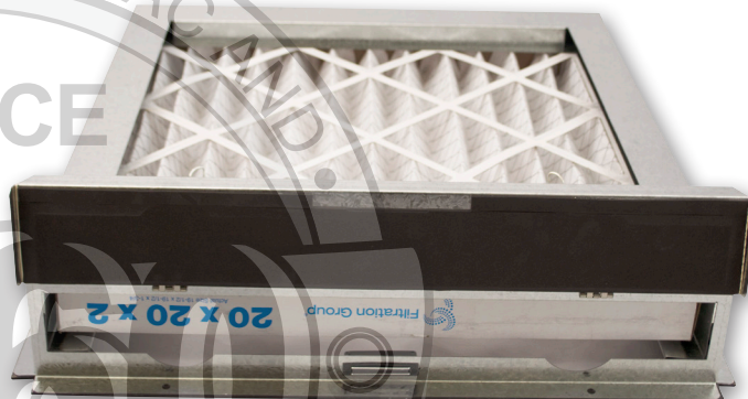
Filter base when open