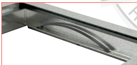
Leaf Spring Design