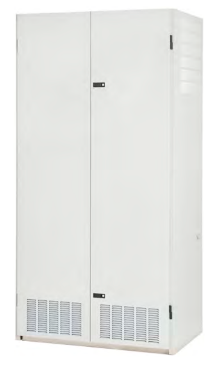
IH - Series Air Source Heat Pumps