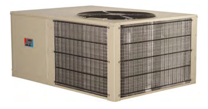
PA - Series Air Conditioners PH - Series Air Source Heat Pumps

QA - Series Air Conditioners QH - Series Air Source Heat Pumps QW - Series Water Source Heat Pumps