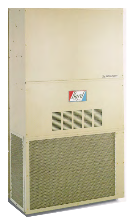
WA & WL - Series Air Conditioners WH & SH - Series Air Source Heat Pumps

For all Packaged Systems (Air Conditioners and Heat Pumps)