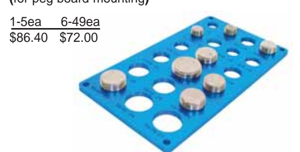
08-9412 Aerator Thread Gauge (for peg board mounting)

(for peg board mounting) 1-5ea 6-49ea $79.20