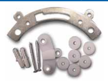
08-0404 Spanner Flange w/ hardware