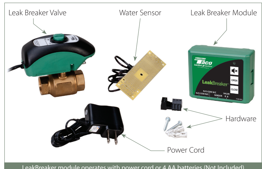
LeakBreaker module operates with power cord or 4 AA batteries (Not Included)

The Taco LeakBreaker is installed on the incoming cold water supply to the water heater, shutting off the water to a leaking water heater. The plumb and plug design is specifically engineered for use on a new or retrofit installation. Components are pre-wired to simplify the installation process, just plug in the sensor, valve, power supply and/or batteries. LeakBreaker can be tested anytime and then be reset to guard against a future leak.