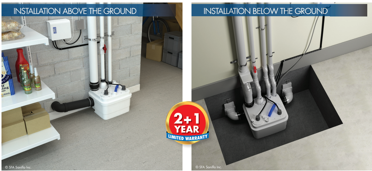
Example of installation. Follow local plumbing codes for actual install.