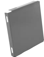
GRAY POWDER COATED END CAP