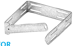
CONNECTOR (Available Standard Galvanized Only)