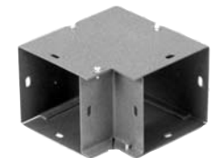
GRAY POWDER COATED 90° ELBOW