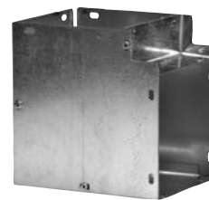
GALVANIZED 90° ELBOW