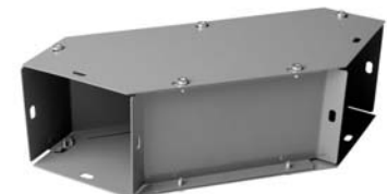
GRAY POWDER COATED 90° SWEEP ELBOW

Prices subject to change without notice Replaces all previous prices