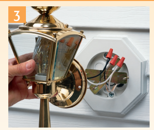
Secure mounting block with provided screws. Install fixture per manufacturer's instructions.