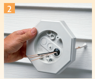
Remove knockout from electrical box and insert cable connector. Push cable through connector and position mounting block onto siding.