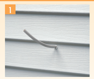
Select location for light fixture and caulk opening around cable.