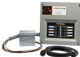
30 AMP Pre-wired Switch Kit Model 6854