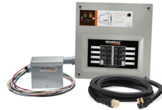
50 AMP Pre-wired Switch Kit Model 9855