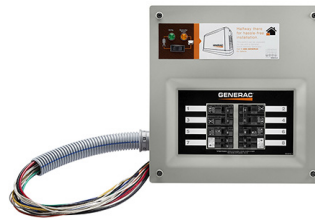
50 AMP Pre-wired Switch Model 9854