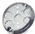
3 3/4" Shallow Pancake Box

The Elite LED lighting system carries a five-year carefree warranty for parts and components. (Labor not included)