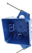
3 3/4" Square (Plastic) with Mud Ring