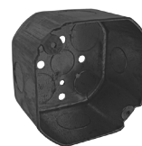
Fire Rated J-Box

Note: A 2-1/8" deep octagon junction box is recommended for through circuit wiring applications.