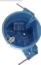
3 3/4" Round (Plastic)