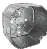
3 3/4" Octagonal (Metal)