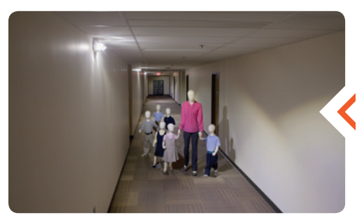
Quantum® ELMLT unit at one and 90 minutes