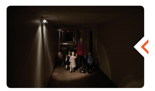
Typical unit at 90 minutes