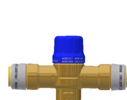
Note: Flow rate determined on a Heatguard ^{\circledast} 110-D LF with 1\!\!\!/ \!\!\!/ 2" sweat fittings