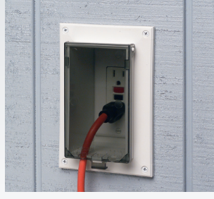
Accepts most single gang wiring devices, and uses a standard indoor wall plate. DBVR1C shown.