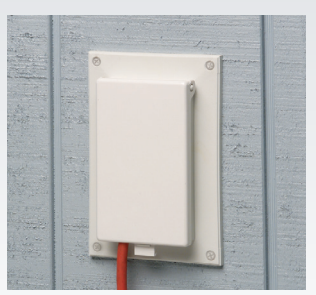
DBVR1W shown. IN BOX Saves Time. Looks Great!