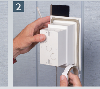
Apply the supplied caulk around back edges of flange. Install NM cable connector and wire, then press onto surface.