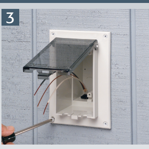
Attach IN BOX with stainless steel screws (provided).