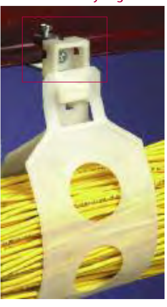
Parallel mounting on 1/4" beam