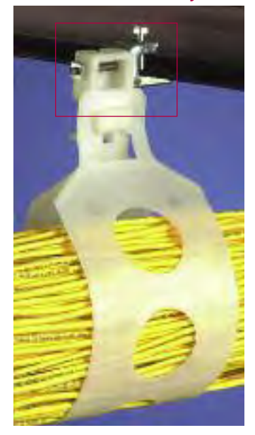
SINGLE LOOP Perpendicular mounting on 1/4" beam clamp