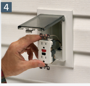
Install wiring device per manufacturer's instructions, Local and National Electrical Codes.