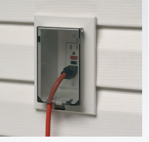
Completed installation with weatherproof-in-use cover. DBVS1C shown.