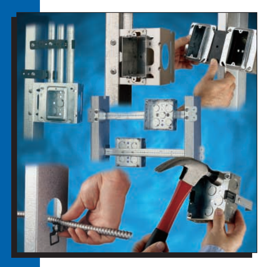
CADDY® Fasteners for Stud Wall Applications