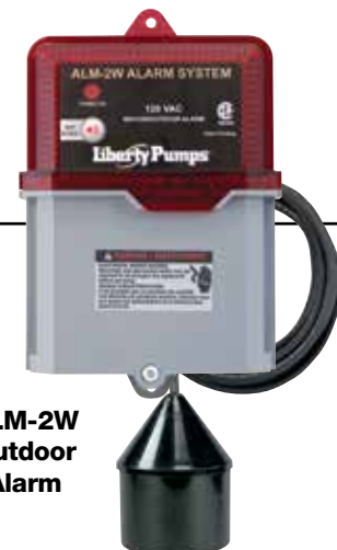
ALM-2W Outdoor Alarm